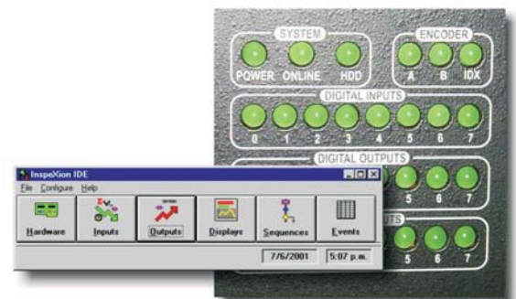
InspeXion® Interface and Front Panel LEDs

The operator interface consists of a keyboard with mouse, and a standard SVGA monitor (monitor not included). An optional 10.4 or 14 inch touch screen monitor can be ordered with the 300 Series. Navigation through the configurable screens, menuing and messaging system provides operator access for data entry, programming, calibration, setup, and test process feedback. Access to the power on/off switch, reset switch, floppy disk drive, rewritable CD-ROM and removable hard drives* is gained through a front panel door. Front panel LEDs (Light Emitting Diodes) indicate system power status, system on-line status, hard drive activity, digital I/O channel status, the active analog channel, and encoder activity.