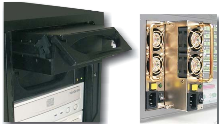
Redundant Hard Drives and Power Supplies

Some of the 300 Series are outfitted with redundant power supplies and hard disk drives. This increases the fault tolerance of the system and results in minimal down time by replicating the data from one drive to another and by including a second power supply in parallel.