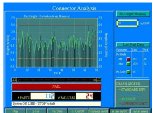
Connector Analysis Screen showing Pin Height